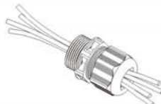
多孔型 Multi-hole type